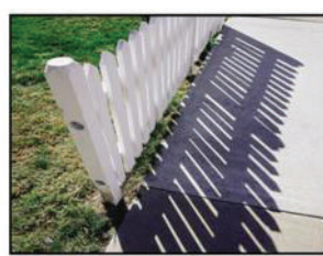
SECURE GATED YARD