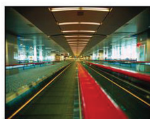
2 MINUTES TO BATTERY TUNNEL